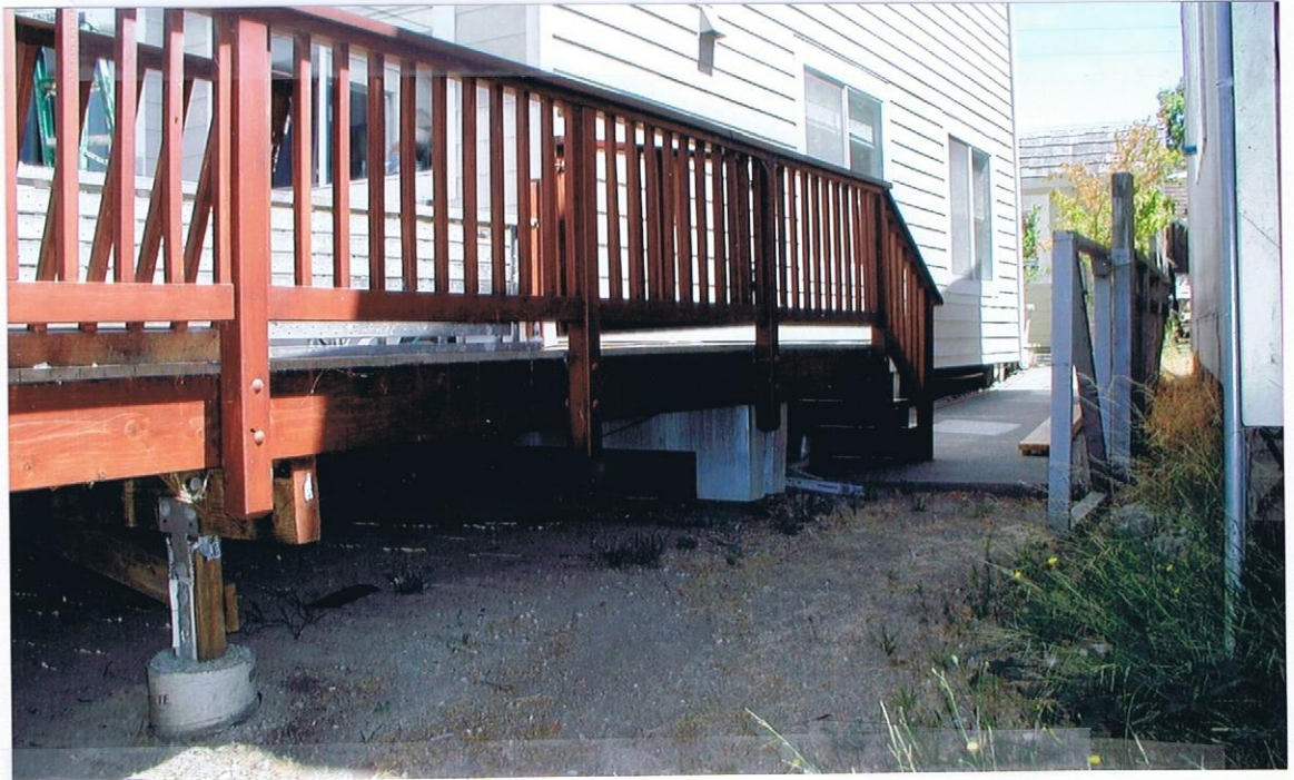
Left Side View From Back of House 7-16-12