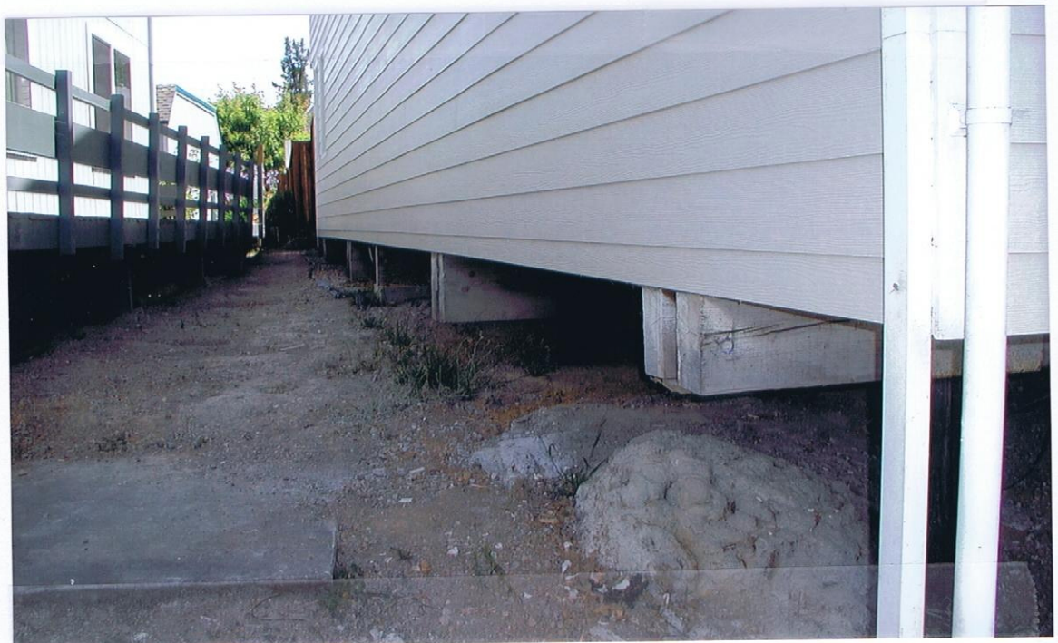
Right Side View From Back of House 7-16-12