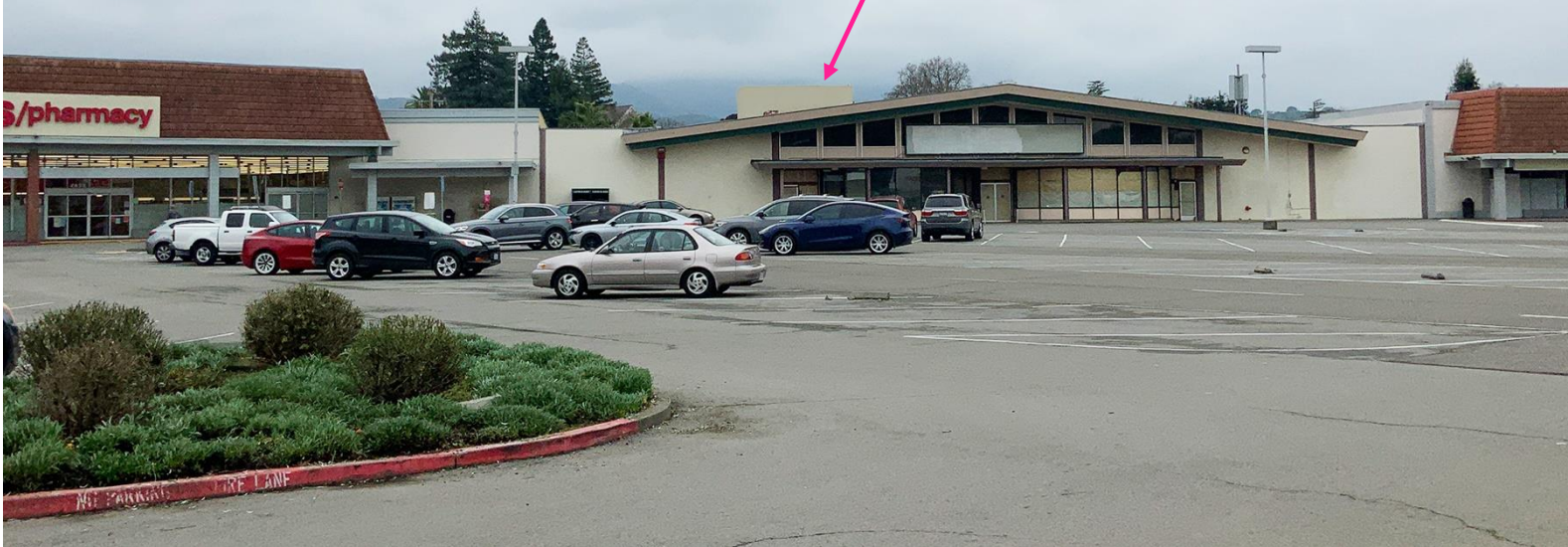
VIEW 1 – LOOKING SOUTHWEST FROM PARKING LOT

PROPOSED NEW ANTENNAS MOUNTED INSIDE EXISTING SCREEN ENCLOSURE. SOME EXISTING PANELS TO BE REPLACED WITH FRP PANELS FOR NEW ANTENNA LOCATION PENETRATIONS.