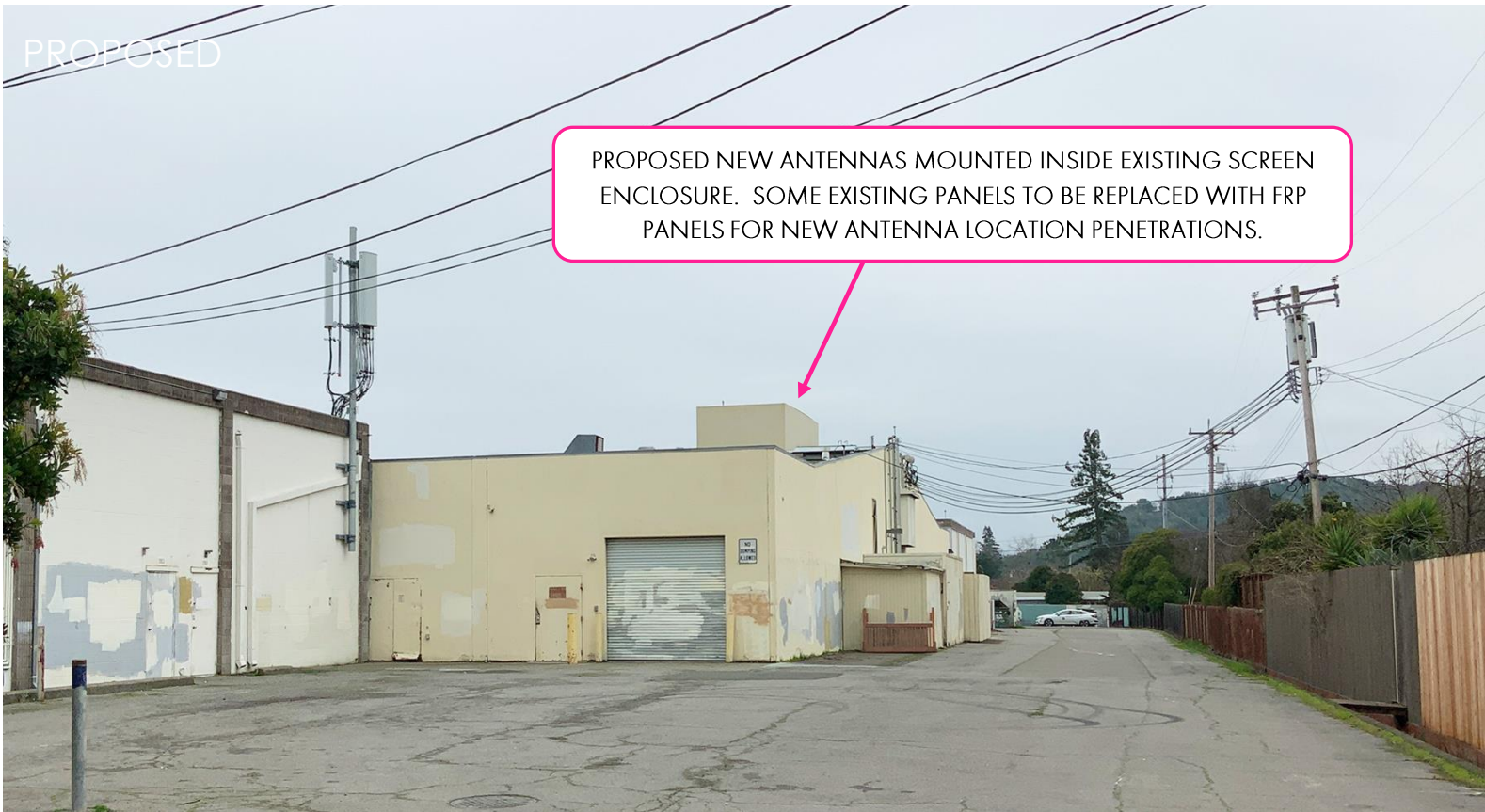
VIEW 4 – LOOKING SOUTHEAST FROM ALLEY WAY BEHIND BUILDING

PROPOSED NEW ANTENNAS MOUNTED INSIDE EXISTING SCREEN ENCLOSURE. SOME EXISTING PANELS TO BE REPLACED WITH FRP PANELS FOR NEW ANTENNA LOCATION PENETRATIONS.