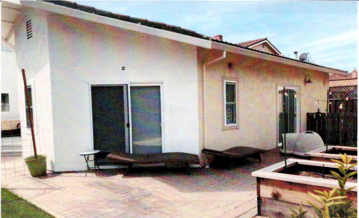
Photo Two Caption Rear View - 04/06/2023