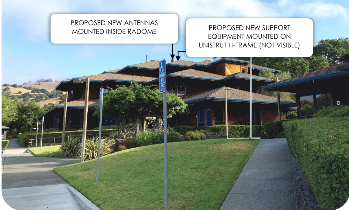
View 3: Looking north across parking lot | Photosim produced 09/02/2021

PROPOSED NEW SUPPORT EQUIPMENT MOUNTED ON UNISTRUT H-FRAME (NOT VISIBLE)