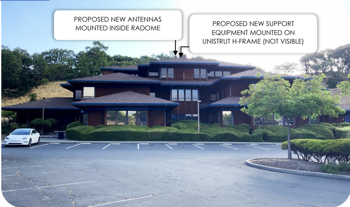
View 1: Looking northwest across parking lot | Photosim produced 09/02/2021

PROPOSED NEW SUPPORT EQUIPMENT MOUNTED ON UNISTRUT H-FRAME (NOT VISIBLE)