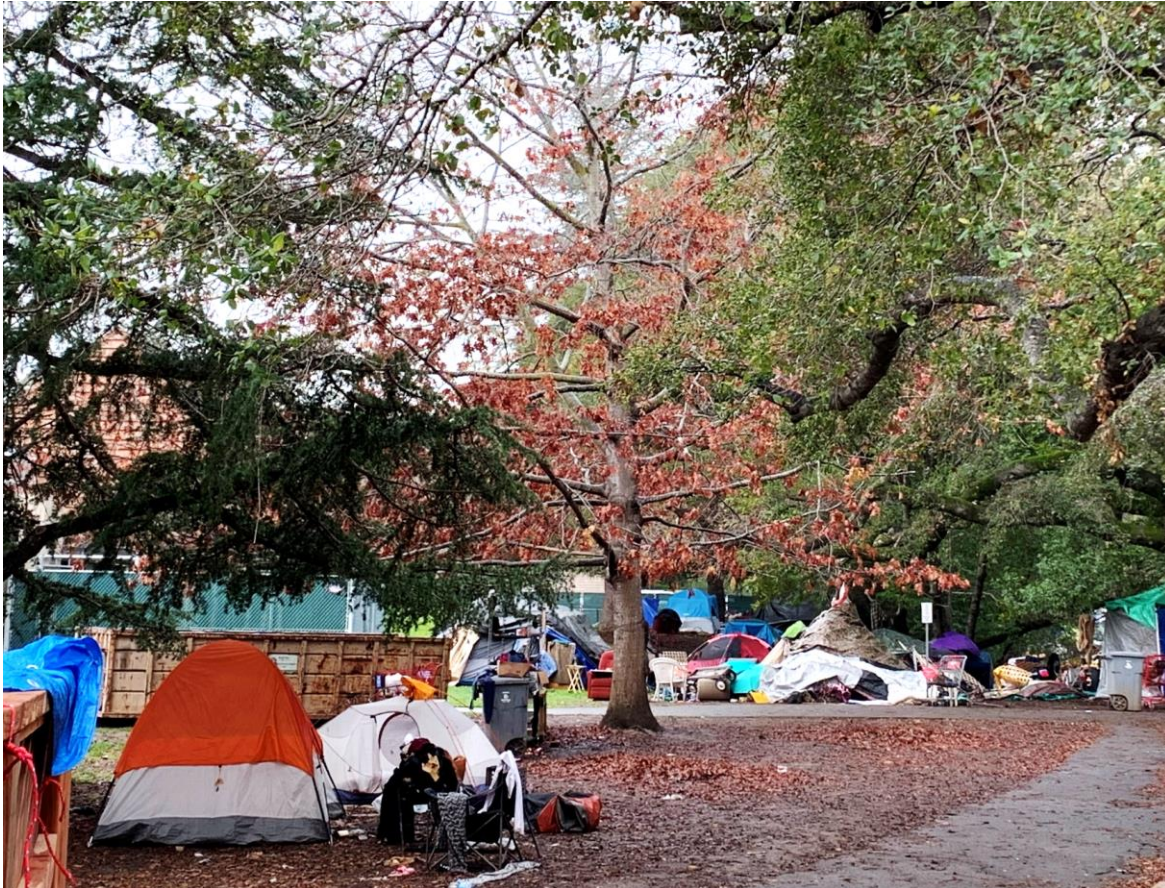
January 5, 2022