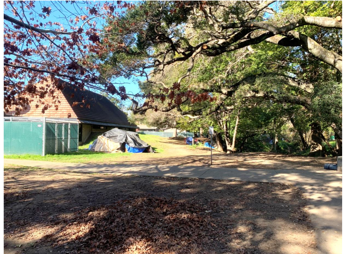
January 25, 2022