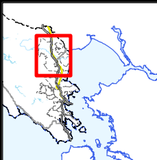
FIGURE 3-2 NOVATO BICYCLE PLAN EXISTING BIKEWAYS AND SUPPORT FACILITIES