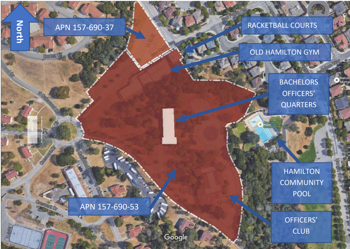
Figure 2: Offering Map