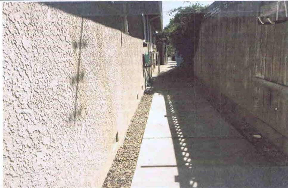
Left Side View August 1, 2019