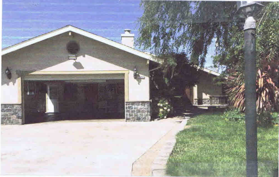
Front View August 1, 2019

If using the Elevation Certificate to obtain NFIP flood insurance, affix at least 2 building photographs below according to the instructions for Item A6. Identify all photographs with date taken; "Front view" and Rear view"; and, if required, "Right Side View" and "Left Side View." When applicable, photographs must show the foundation with representative examples of the flood openings or vents, as indicated in Section A8. If submitting more photographs than will fit on this page, use the Continuation Page.