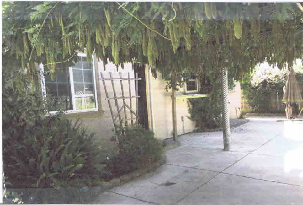
Rear View August 1, 2019