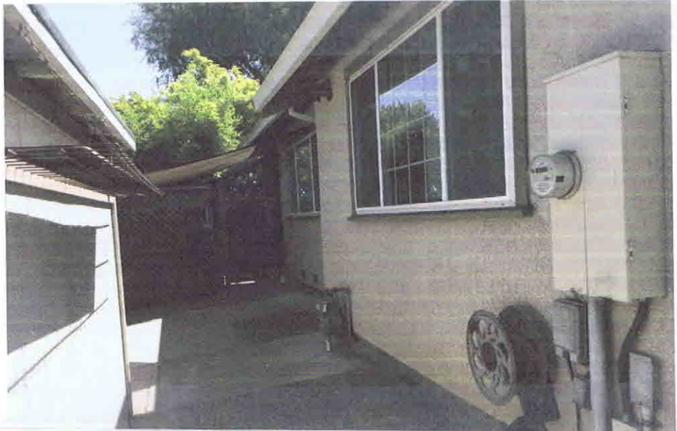
Right Side View August 1, 2019

If submitting more photographs than will fit on the preceding page, affix the additional photographs below. Identify all photographs with: date taken; "Front View" and "Rear View" and, if required, "Right Side View" and "Left Side View." When applicable, photographs must show the foundation with representative examples of the flood openings or vents, as indicated in Section A8.