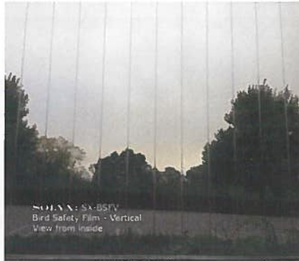
VIEW FROM INSIDE