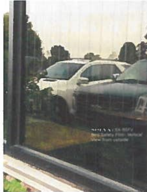
VIEW FROM OUTSIDE