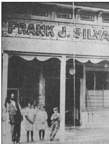
ca. 1906, 824 Grant Avenue