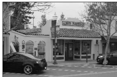
ca. 2013, 818 Grant Avenue

entire business and residential complex to his next lot east and remodeled that building into one large store with a three-room apartment in the rear.