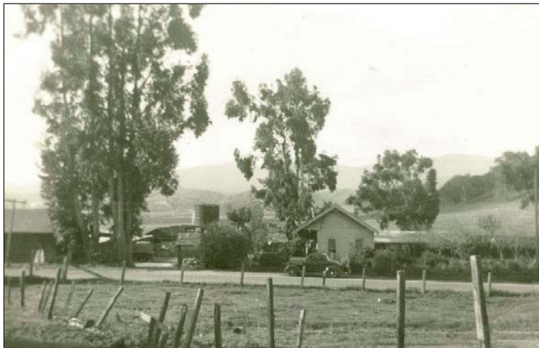
The first Louie home on the south side of Olive Avenue.

changed the operation into a Peking duck farm. It is this Louie Duck Farm, with its population of between 4,000 and 5,000 ducks in their pens, that our old timers still remember.