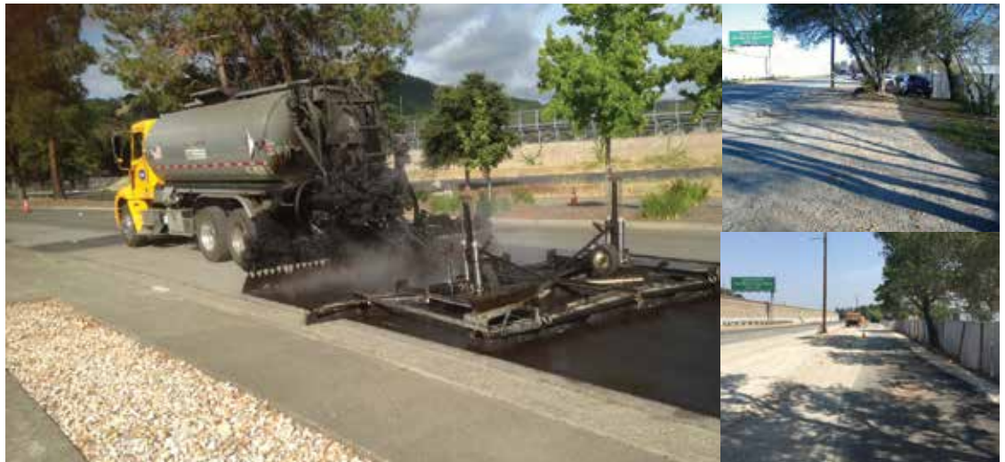
(Clockwise from left) 1. Resurfacing. 2. Nave Drive multi-use pathway, before. 3. Nave Drive multi-use pathway, in progress.